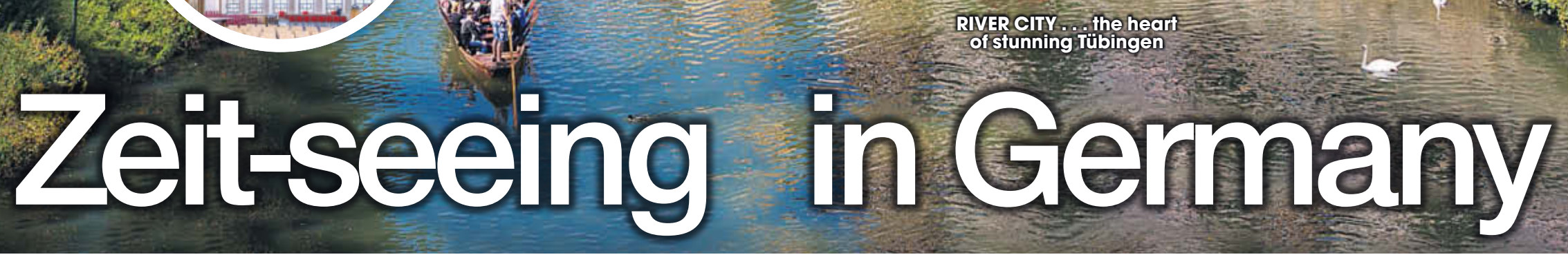
RIVER CITY... the heart of stunning Tübingen