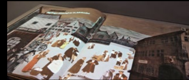
»Das Lebende Buch« (»The living book«) presents an introduction to the Fugger and Welser Museum