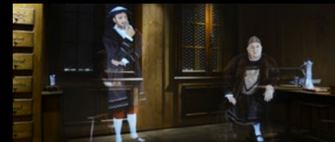
A virtual drama – the dialogue in Jakob Fugger's »Golden Office« at the Fugger company headquarters