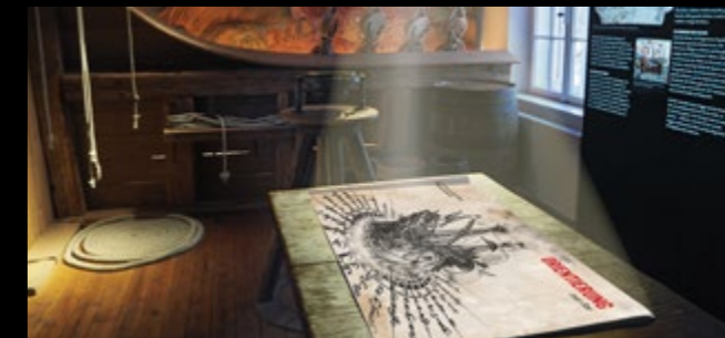
Trading routes of the Welsers to Venezuela