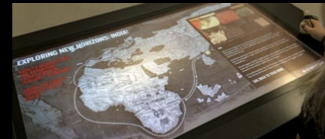
An interactive media table showing the trade routes to India